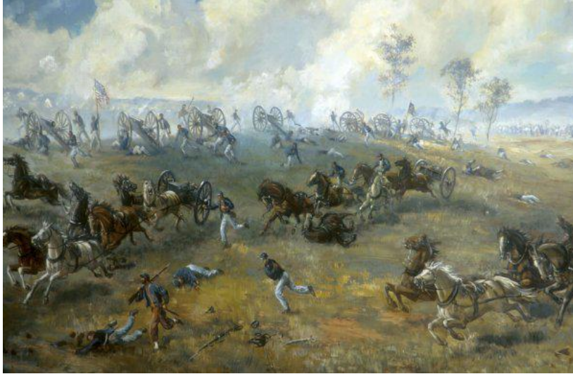
"The Capture of Rickett's Battery" by Sidney King, 1964 (oil on plywood).

2011 is the 150 th Anniversary of the beginning of the American Civil War.