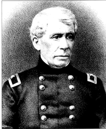
Brig. Gen. George Wright