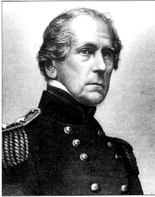
Maj. Gen. John Wool