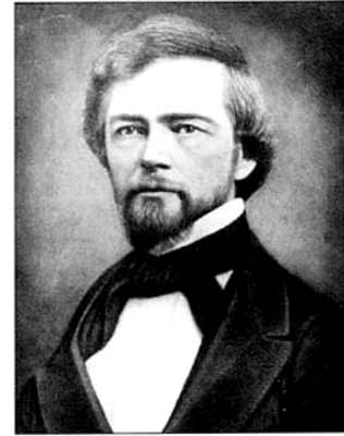
Governor Isaac Stevens